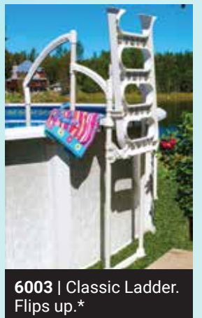
-0040 / PG-7000_EN REV02/23 AVAILABLE: QC | CA | US | INT