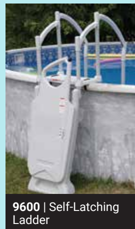
9600 | Self-Latching Ladder