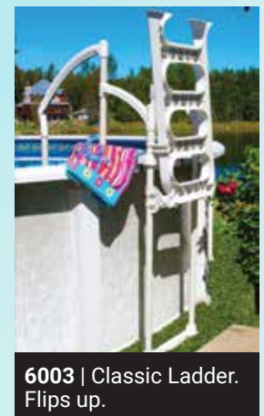
6003 | Classic Ladder. Flips up.