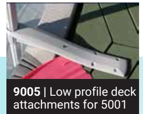
9005 | Low profile deck attachments for 5001